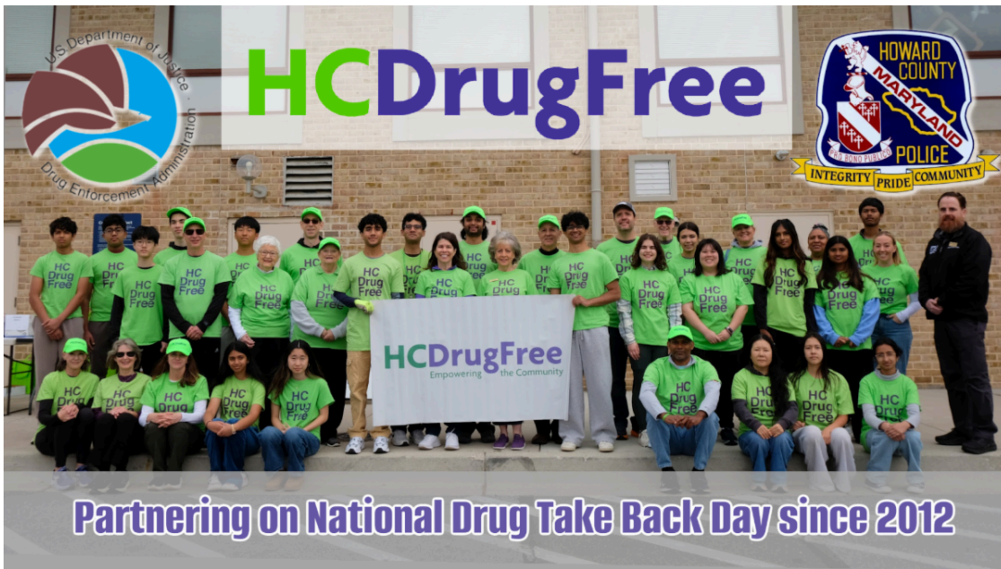
Pictured above (morning shift): Some of HC DrugFree's many student, adult, and medically trained adult volunteers standing together in the Wilde Lake Village Center to keep our community safe