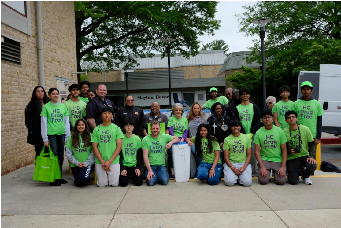
Pictured above (afternoon shift): More of HC DrugFree's team and partners with the 43 bins of medications collected in 4 hours