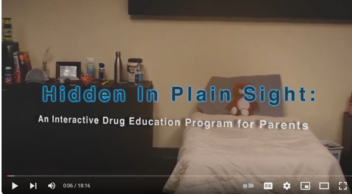
Hidden In Plain Sight: An Interactive Drug Education Program for Parents (2021)