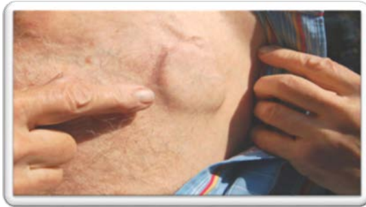
Pacemaker or implanted device